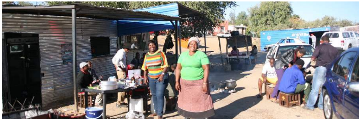
Traders at Herero Mall informal market in Katutura.

In the 19 th and 20 th century urbanization has occurred in many parts of the world with industrialization forming the basis of supporting urban livelihoods. However, historically Namibia's economy has been based on resource-extraction, with minimal production and value addition to support urban jobs and negligible local demand. With Namibia gaining independence in an era of highly competitive globalizing markets, 'traditional industrialization' such as other countries have experienced is increasingly unlikely. Namibia largely experiences jobless growth 38 and unemployment is high and increasing, already 67% of employment lies within the informal sector, following larger continental trends 39 . Considering that women are most active in the informal sector 40 , housing strategies enabling informal livelihood generation are an affirmation towards gender equality. Considering a population largely generating livelihoods in the informal economy is important when developing policies and programmes, which are often based on the assumptions of widespread formal employment driven by industrialization.