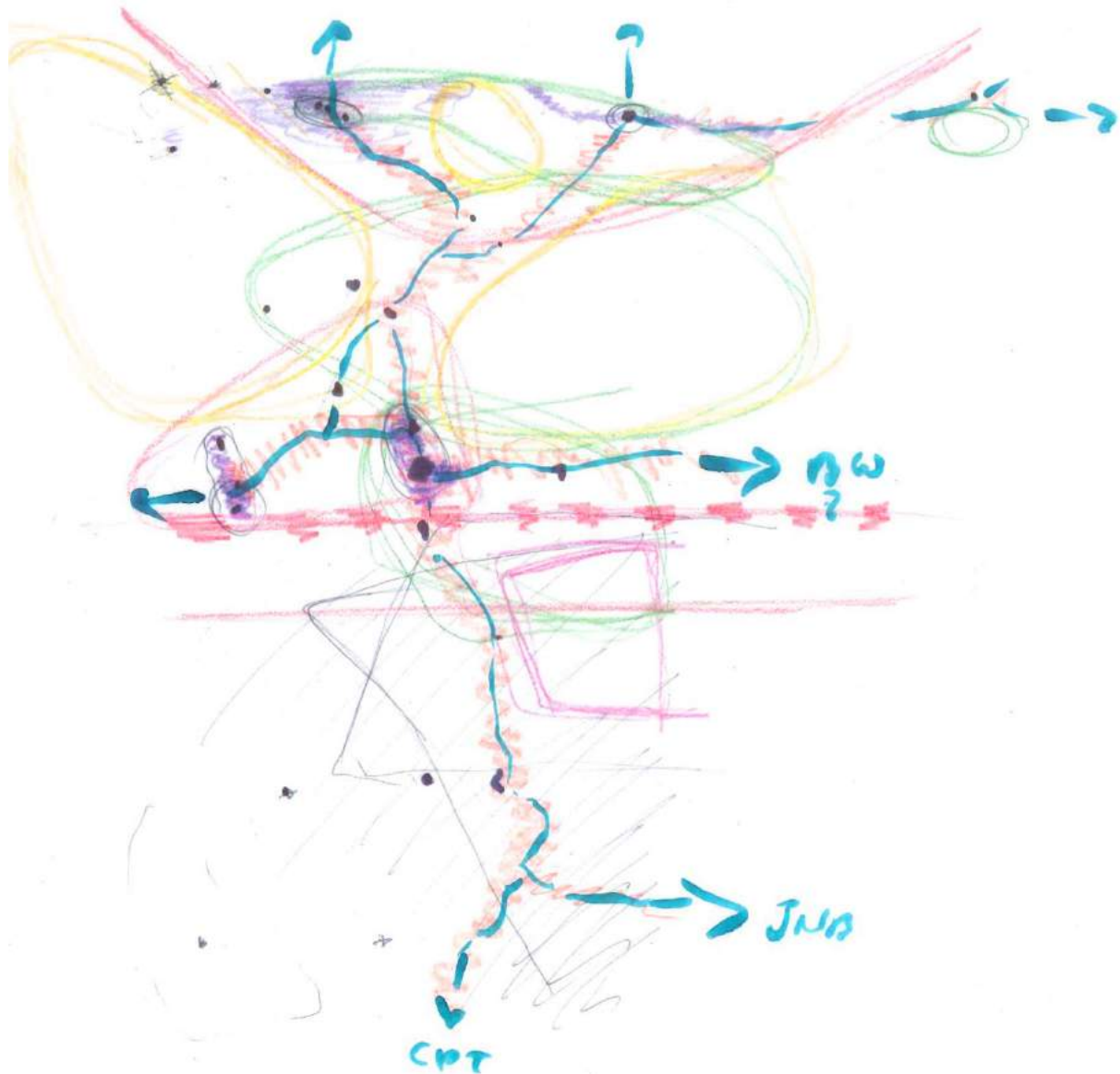
Speculative territorial development map of Namibia: map by author.

villages and other urbanizing areas. Matters of bulk infrastructure, such as water and electricity, employment and support to informal economies, are part and parcel to this. An urban land reform programme should overhaul the spatial inequality that characterises Namibia's entire territory.