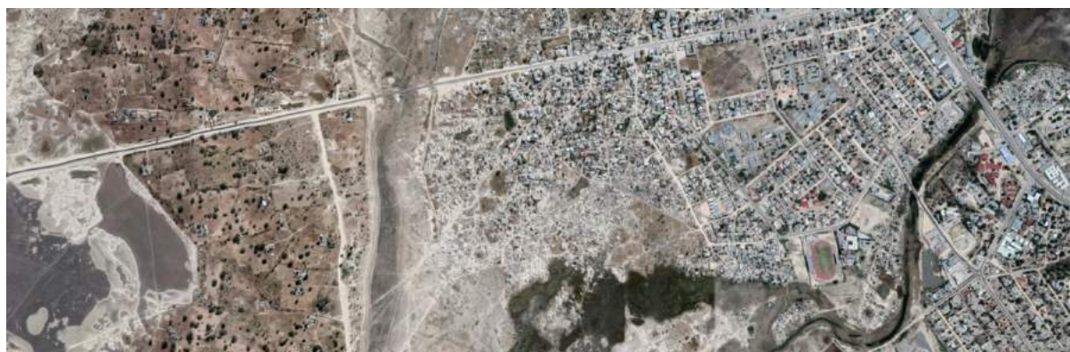
Urbanization as historical process ranging across rural-urban divides: Oshakati.

Furthermore, such planning is not reduced to the jurisdiction of one government office, ministry or agency, but should be coordinated from a high-level body such as the National Planning Commission or Office of the Prime Minister, bringing the various O/M/As to account, and drawing on ample expertise in the national universities, as well as in the private and civil society sectors. All of these should be part of the process of re-imagining the spatial future of the country.