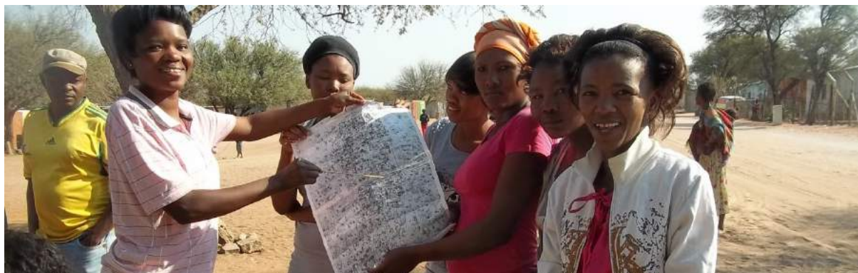
Community-led mapping in Gobabis.

There is increasing recognition that unlawful occupation of urban land may be socially-legitimate where there is no available mechanism to access land, and some governments are taking an accommodating approach 37 .