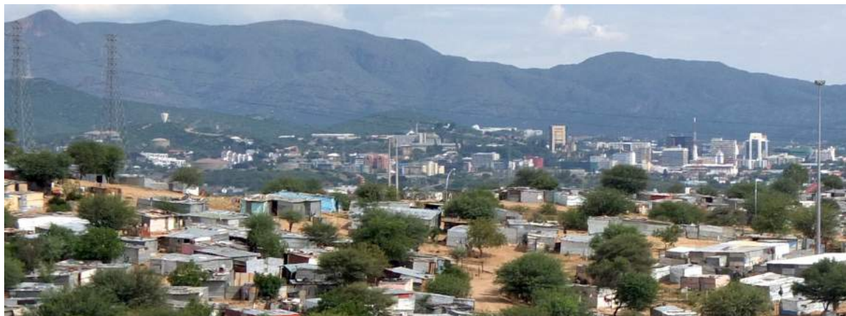
Spatial segregation continues to structure most Namibian urban spaces: Windhoek.

Land delivery is undertaken by various professions that are regulated 43 , including legislated minimum fees 44 . This in turn informs university curricula, largely educating future professionals how to perform in 'the formal sector' 45 , and often side-lining more realistic, but complex developmental challenges.