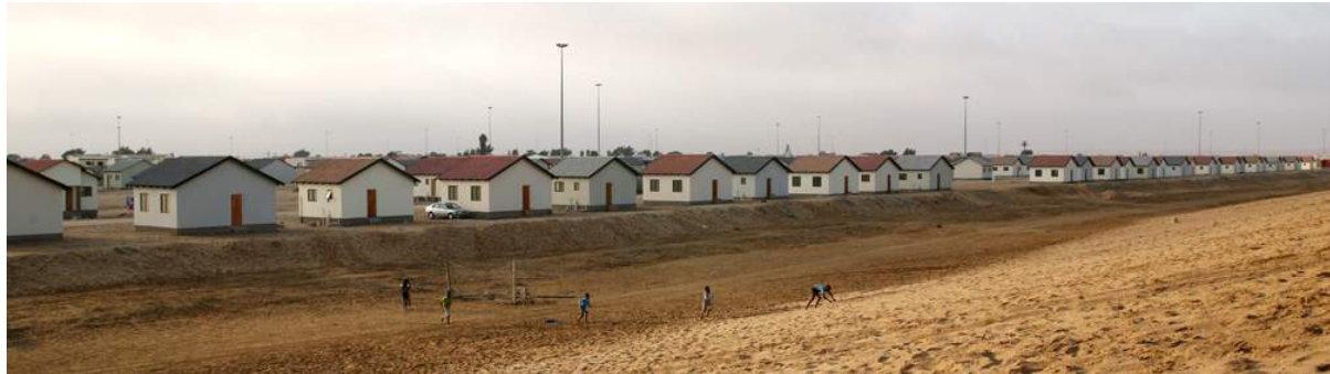
Completed yet largely vacant MHDP-1 houses in Walvis Bay, 2015

> The 2018 NLC must commit urban land reform efforts to be directed to improve the situation for the urban poor in order to have the widest possible effect as this group represents the vast majority of citizens in the near future.