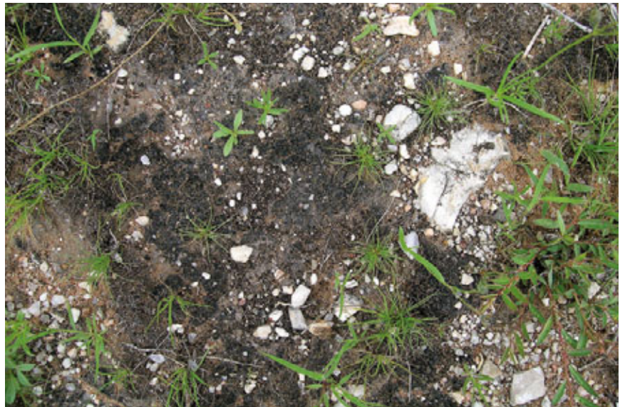
Photo 2: Soil-inhabiting lichens in the Savanna Biome (Otjiamongombe).

This study suggests that there is potential to use species number of lichens as a predictor of the effects of future climate change, however further studies are necessary for a better understanding of the bioindicative value of lichens in southern Africa. It is expected that a reduction of air humidity, fog, dew and rainfall, and increasing temperatures as a consequence of predicted global climate warming, would have a significant negative influence on lichen diversity within the study area.