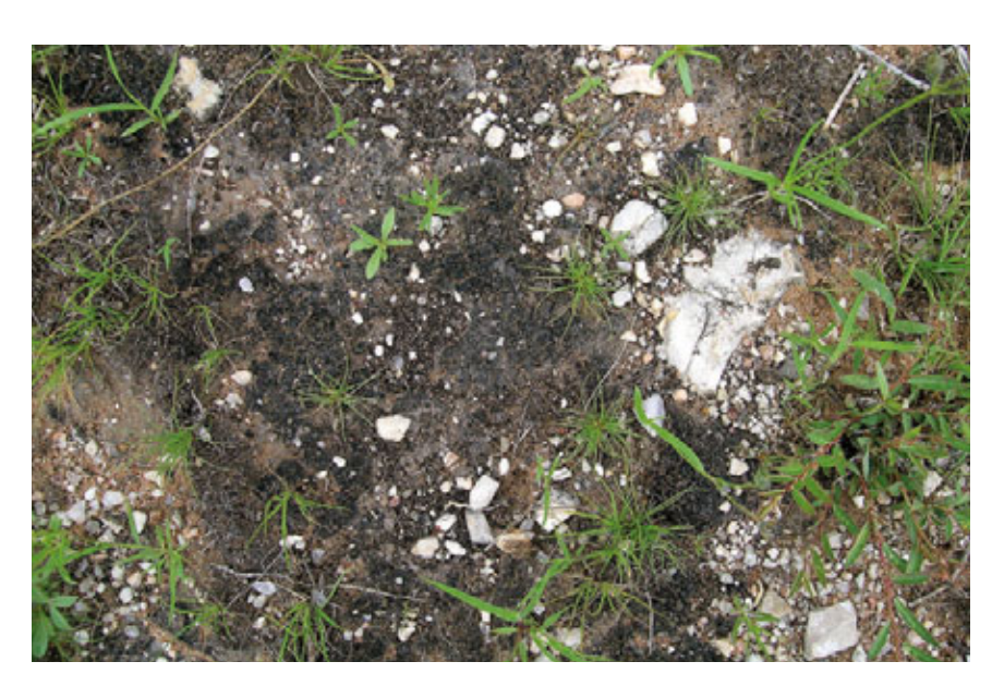
Photo 2: Soil-inhabiting lichens in the Savanna Biome (Otjiamongombe).

This study suggests that there is potential to use species number of lichens as a predictor of the effects of future climate change, however further studies are necessary for a better understanding of the bioindicative value of lichens in southern Africa. It is expected that a reduction of air humidity, fog, dew and rainfall, and increasing temperatures as a consequence of predicted global climate warming, would have a significant negative influence on lichen diversity within the study area.