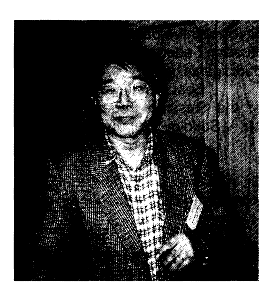
Prof. Kiyoshi Amano (Japan)

Great consideration was paid to the problem of training and re-training of personnel for teaching people with special needs and the necessity of creating educational modules for training and self-training of people with special needs.