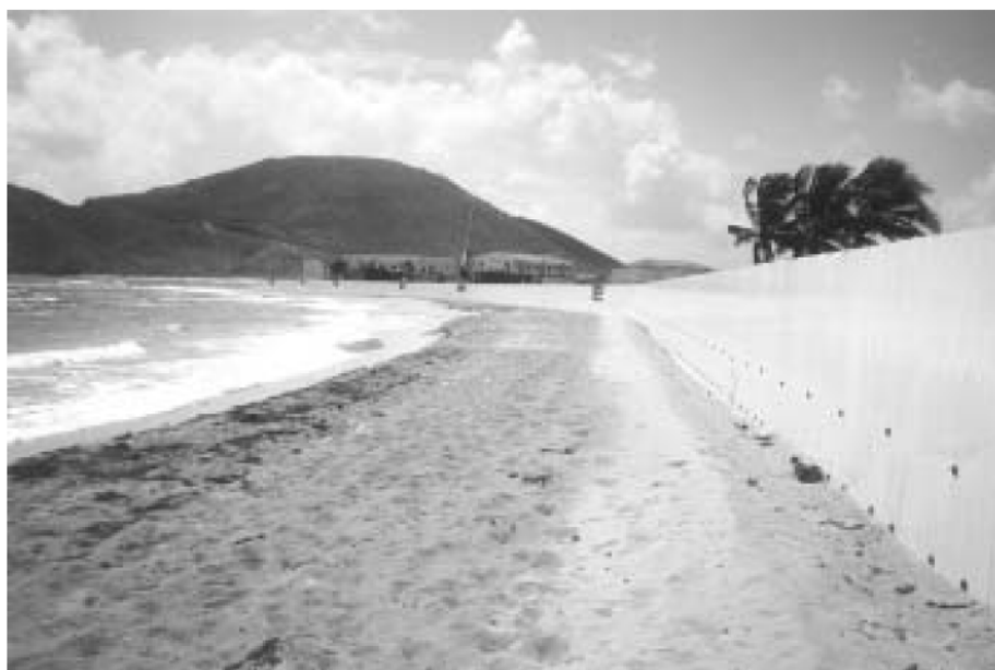
Photo 9. Seawall at North Frigate Bay, St Kitts. February 2000.

The main partner agency in St Lucia is the Department of Fisheries (DF). This agency has been monitoring several beaches in St Lucia since 1990 with the assistance of various NGOs, e.g. the Soufriere Marine Management Area and the St Lucia National Trust. However, it is very difficult to get sustained assistance from other agencies, and the data received is often not continuous and/or unreliable. The officer in charge of the monitoring programme was away on study leave (from the end of 1999 until the end of 2000), so during this period, monitoring ceased. However, the monitoring has since restarted from the beginning of 2001. During this CDB-UNESCO project, the ‘Beach Profile Analysis’ programme was installed on computer at the DF and demonstrated to two other officers from the Department. The beach-monitoring database dates back to 1990. A second beach-monitoring database, focusing only on the northwest coast, was established as one of the activities of the Northwest Coastal Conservation Project (Phase 2). Three years data were collected by this project, which terminated