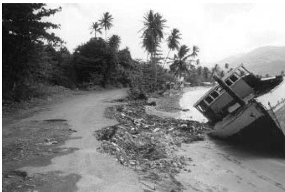
Photo 5. Evidence of the ravages of recent hurricanes, Prince Rupert Bay, Dominica. February 2000.

'Beach Profile Analysis' programme and two will require further training. The software and database were also demonstrated to officers from the Physical Planning Unit, who readily perceived its relevance