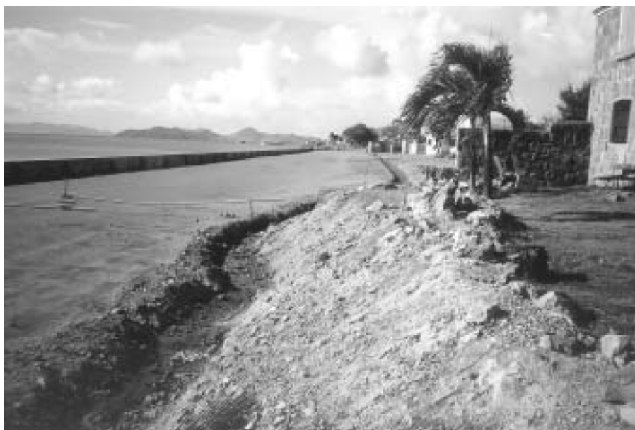
Photo 8. Reclaimed land at Charlestown, Nevis. September 2000.

base have also been installed at the Department of Planning and Development and two persons there trained in its use.