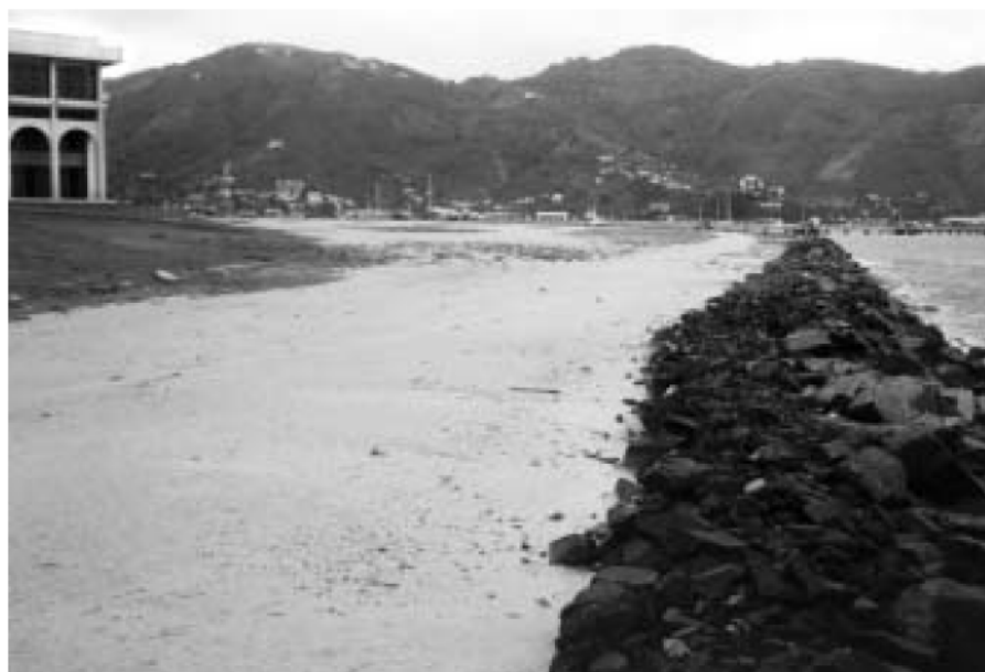
Photo 4. Rock revetment protecting the Government Administration Building, Road Town, Tortola, British Virgin Islands. May 1998.

tion and assessment of new structural developments, changing beach uses, restriction of beach access, nature of beach dynamics etc. So officers involved in monitoring become knowledgeable about all aspects of their island's beaches and can