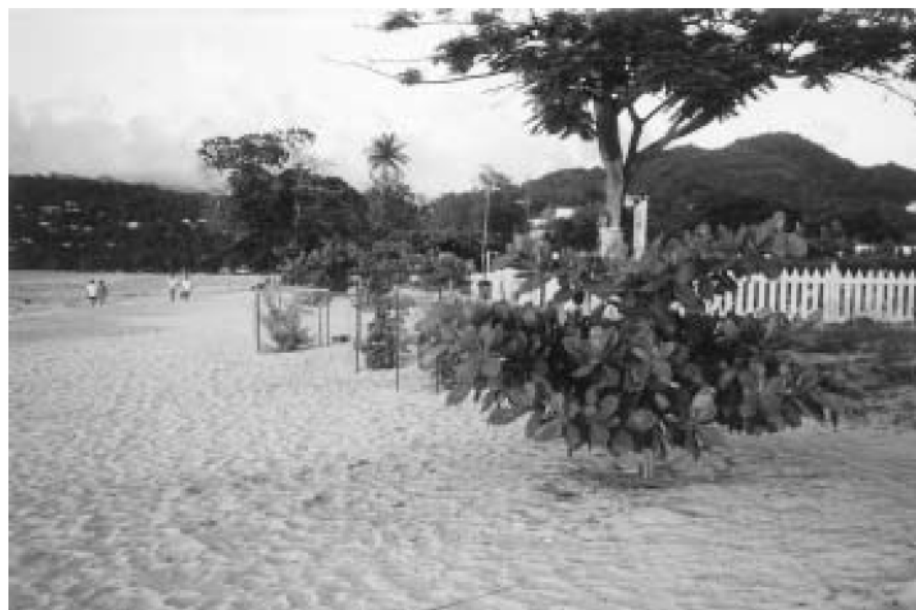
Photo 6. Replanting efforts at Grand Anse, Grenada. September 2001.

Responding to this concern, a visit was made to Grenada two weeks after Hurricane Lenny to assess the damage and make recommendations for rehabilitation. (This visit was funded by the CDB-UNESCO project and the Organization of American States.) Following several meetings, a report was produced (Cambers 1999a) advising the Grenadian authorities not to rush to construct remedial structures, but rather to wait for natural beach recovery. After the visit, a committee was organized comprising the Board of Tourism, the Forestry Department, the NSTC, the Organization of American States, several hoteliers and others, to implement the recommendations of the report which included a beach planting programme and the removal of certain damaged structures. As predicted, the beach recovered following the hurricane; this can be seen visually and in the monitoring data, although more time will be required to determine whether the beach fully recovers to its pre-hurricane size.