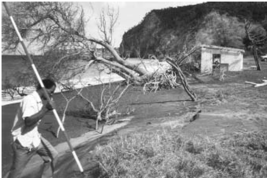
Photo 7. Foxes Bay, Montserrat, one month after Hurricane Lenny, December 1999.

The beach-monitoring database was used by the Physical Planning Unit during the period 1992–1995, when a programme was established to stop the mining of beach sand at all beaches except Farms Bay, and to use quarry sand for all construction purposes except the final plastering/finishing of buildings. 6 However, due to the