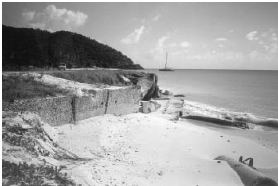
Photo 3. Undermined roadway, Darkwood Beach, Antigua. November 2000.