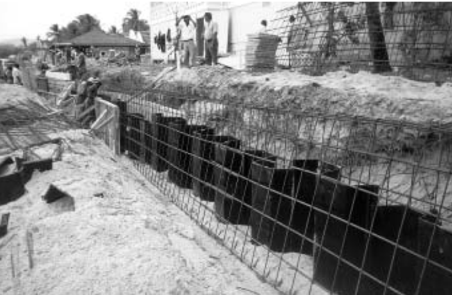
Photo 10. Seawall under construction, Reduit Beach, St Lucia. April 2000.