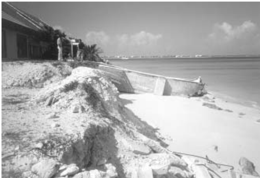
Photo 12. Collapsed pool deck, Pelican Beach, Providenciales, Turks and Caicos Islands. July 2001.

Monitoring was started in the Turks and Caicos Islands in 1995 (in Grand Turk and Providenciales); however, the activity has not been continued and only two data sets exist (one set for 1995 and one set for 1997). As a result of