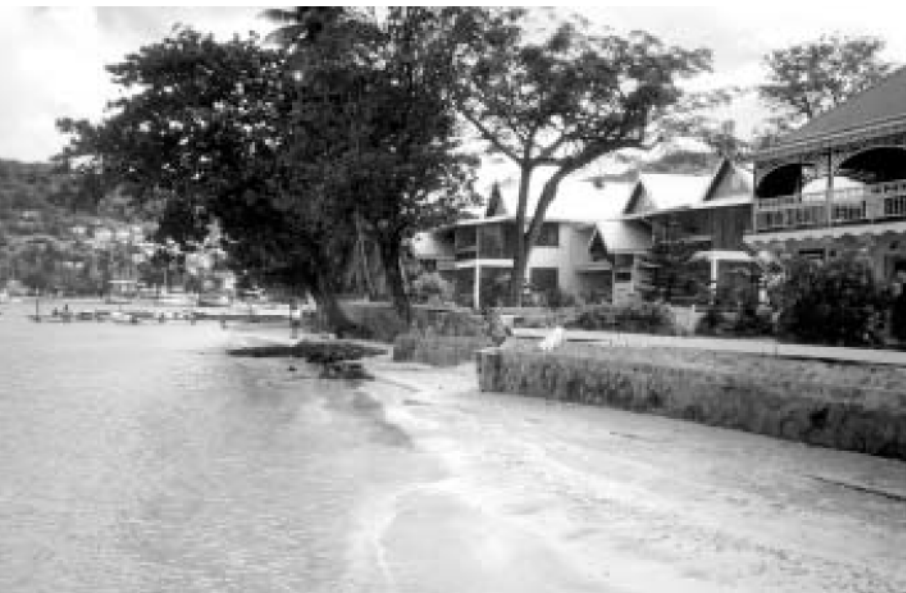
Photo 11. Retaining wall, Port Elizabeth, Bequia, St Vincent and the Grenadines. November 2000.

Another coastal problem in St Lucia relates to beach sand mining, which again has become a serious issue. Sand mining is under the jurisdiction of the Ministry of Communications and Works. Considerable efforts were made in the early 1990s to ensure that this Ministry was fully aware of the adverse impacts of beach sand mining. However, with a very high staff turnover at this Ministry, such efforts have to be continued, so that the impacts of activities such as sand extraction at river mouths are fully understood and remedied.