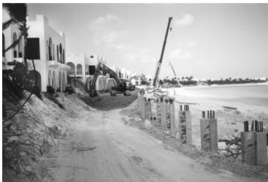
Photo 2. Seawall under construction, Maunday's Bay, Anguilla. September 2000.

opment continues in Anguilla. The narrow sandy barriers separating salt ponds from the sea are prime sites for development. During Hurricane Lenny many of these barriers were breached illustrating their fragility, their vulnerability and their unsuitability for permanent buildings.