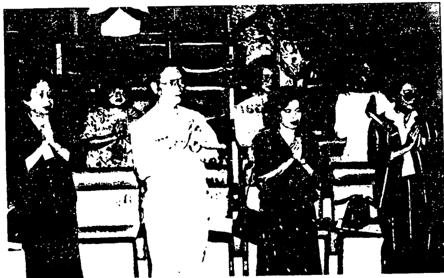
Inauguration of The National Seminar to prepare a Teacher's Handbook on Environmental Conservation