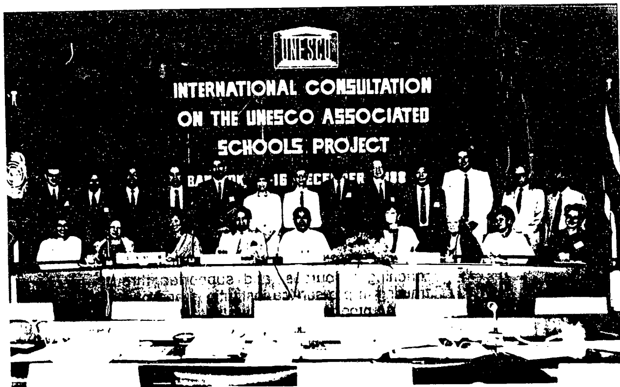
First IRP Consultation at the UNESCO Principal Regional Office for Asia and the Pacific, Bangkok, 1988

The manual concentrates on measures that will increase the use of results from the ASP schools. For information on setting up and running the project, readers may consult: Partners in Promoting Education for International Understanding: Practical Manual for Participation in the UNESCO Associated Schools Project , available from the UNESCO Secretariat.