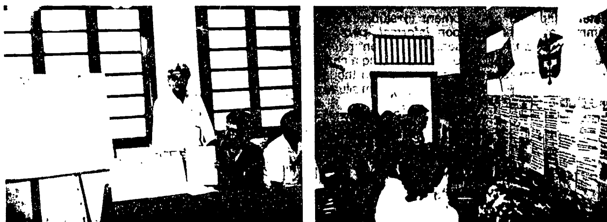
Colombian ASP teachers take part in a workshop on human values education using the METAPLAN technique.

c. Encouraging teacher training institutions to affiliate with the ASP as a means of promoting experimentation with better training methodologies.