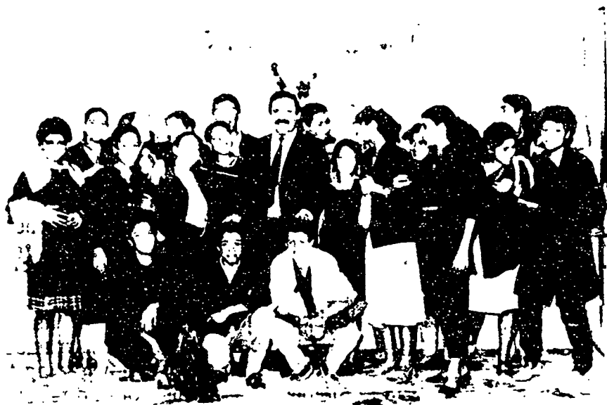
ASP students in Tunisia learn about the work of the United Nations

3. National authorities who encourage international co-operative projects should take steps to ensure that resources are available to permit their own ASP network to fulfill the responsibilities undertaken in the joint enterprise.