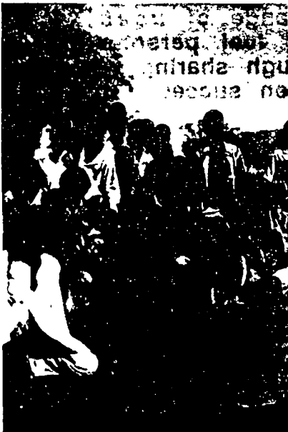
ASP students in Chad struggle against deforestation

In participating countries, the use of extra-curricular and UNESCO club activities has often provided the vehicle for permitting teaching within a highly structured curriculum to be projected outwards into the community, where a far broader range of student activities is possible. In the extra-curricular setting, teachers can set a variety of goals that complement the regular curriculum and may use the stimulus of contact with the surrounding community to motivate students for in-school learning. At the same time, extracurricular activities often are designed in such a way as to provide direct benefits for the community. In many countries, Associated Schools provide through their students a stimulus to local development projects. Tree-planting and similar projects to improve the school and community environment play a large role in countries as diverse as Chad and Colombia.