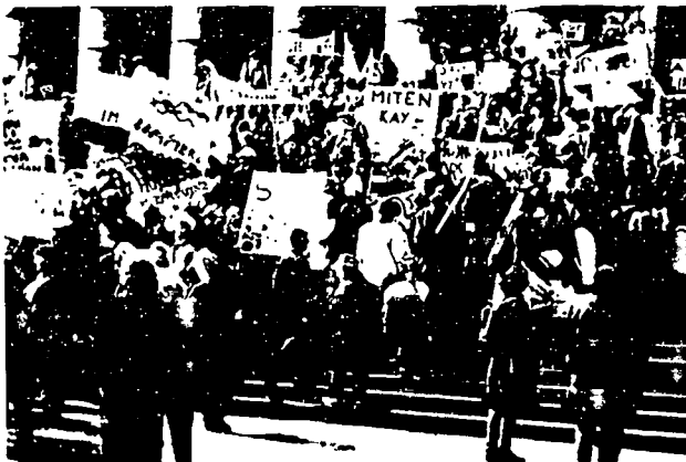
Finnish students meet on the steps of the Parliament to draw attention to issues facing the Baltic Sea

4. Curriculum changes to promote international education should be accompanied by strong measures to renew and improve pre-service teacher training and in-service professional development of teachers. National authorities should take steps, in particular, to make international education a required element in teacher training leading to certification. Encouragement should be given to teacher training institutions to join the ASP and to make use of its facilities as a means of improving teacher training methodologies in international education. Linkages between teacher training institutions and ASP schools at primary and secondary levels should be created to permit teacher trainees to acquire practical experience in innovative classroom activities.