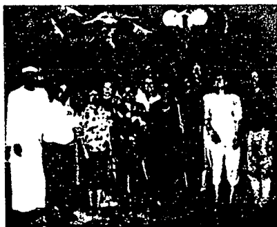
Participants attending Second IRP Consultation in N'djamena, Chad.