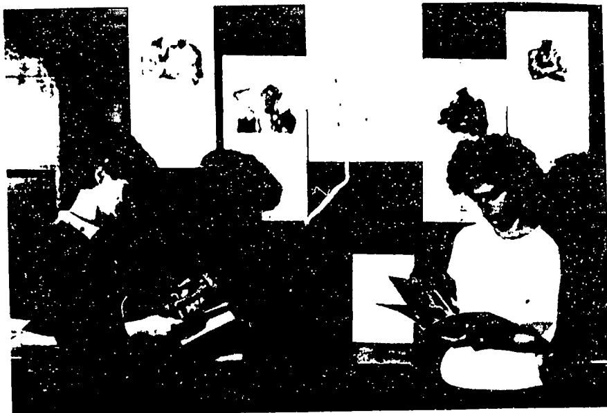
Bulgarian ASP students reflect on human rights issues.