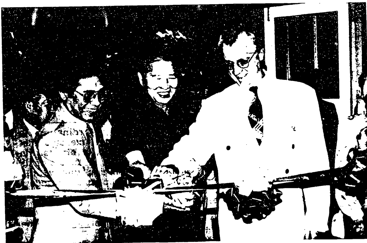
German ASP National Coordinator and Malaysian teacher inaugurate exhibition at International Youth Camp, Pattaya, Thailand

4. Special attention should be given to setting up effective communications, starting at least with a regular project newsletter. Wherever possible, means should be found to organize meetings or workshops where teachers can review results periodically and share results.