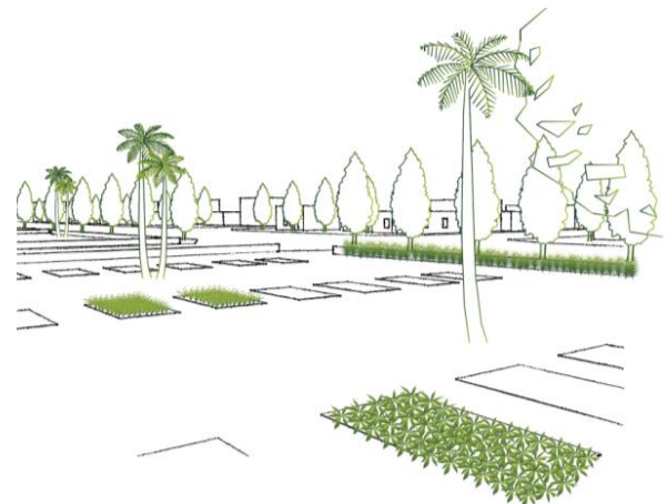
Image left: The green lines/corridors indicate the location of (protected) urban greenways in the city of Bobo Dioulasso (Burkina Faso). Image right: Multi-functional design of urban greenways in Bobo Dioulasso.