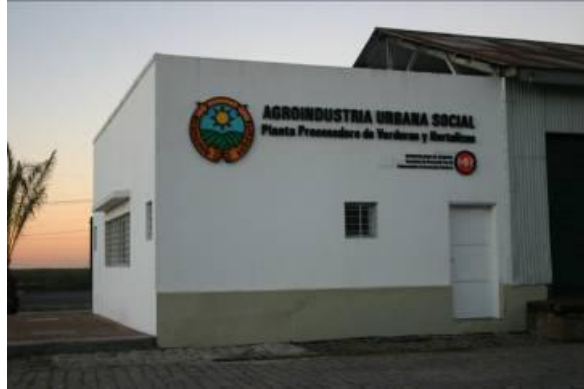
Left: Integrating green and edible trees and shrubs in lane upgrading in a slum settlement in Sri Lanka. Right: Rehabilitation of derelict infrastructure for small food packaging and processing (land area required of only 37m 2 , following all food hygiene related standards).