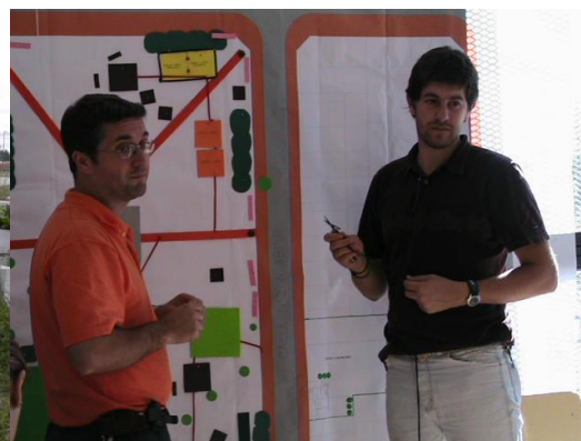
Left: Promoting urban gardening – next to other multiple functions – on built-up spaces such as urban parks. Right: Involving the community in redesign of public spaces.