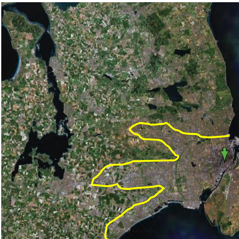
Promoting urban development according to a “finger model” in the City of Copenhagen (Denmark) to preserve agricultural areas and increase access of all citizens to open, green and agricultural spaces.